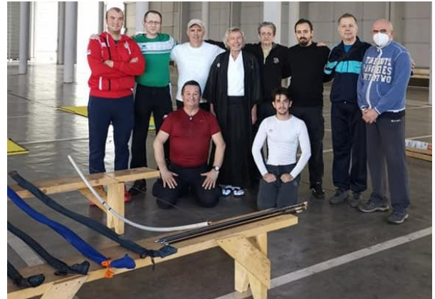
Some of the participants

The invitation to learn Kyudo was not limited to members of the Serbian Archery Federation, nor to the people of Belgrade. Various associations with links to martial arts and Asia have been contacted.