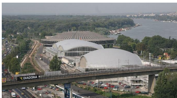
Belgrade Exhibition Centre