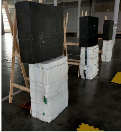
Used version of "Makiwara"

Six cardboard rolls and 6 swimming tubes were purchased to build the Makiwara. As the cardboard rolls were very small, we tried to make 3 Makiwaras with the 6 cardboard rolls, but it was still too small; the solution illustrated below was finally found and proved to be very satisfactory.