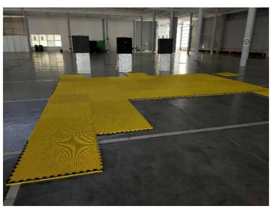
Built-in ground covers

The Serbian Archery Federation loaned various targeting elements in Ethafoam, as well as a safety net.