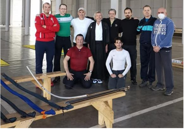
Some of the participants

The invitation to learn Kyudo was not limited to members of the Serbian Archery Federation, nor to the people of Belgrade. Various associations with links to martial arts and Asia have been contacted.