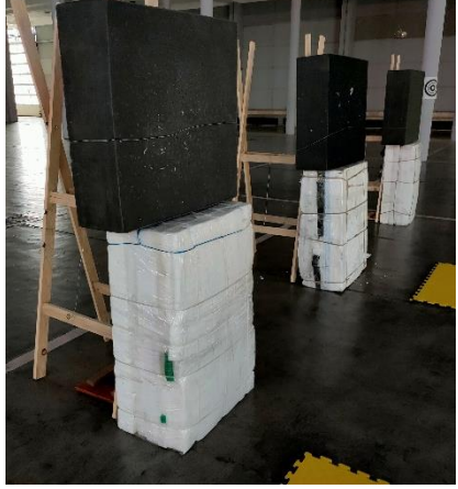
Used version of "Makiwara"

Six cardboard rolls and 6 swimming tubes were purchased to build the Makiwara. As the cardboard rolls were very small, we tried to make 3 Makiwaras with the 6 cardboard rolls, but it was still too small; the solution illustrated below was finally found and proved to be very satisfactory.