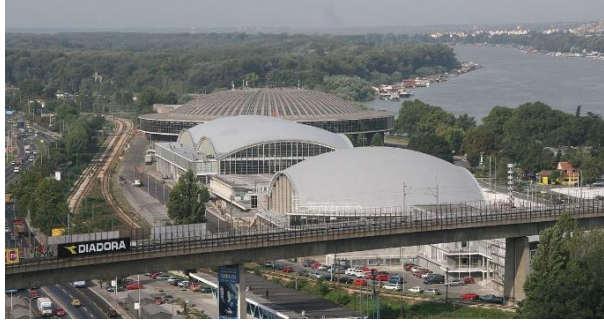
Belgrade Exhibition Centre

* White Eagle has this hall for its rehearsals